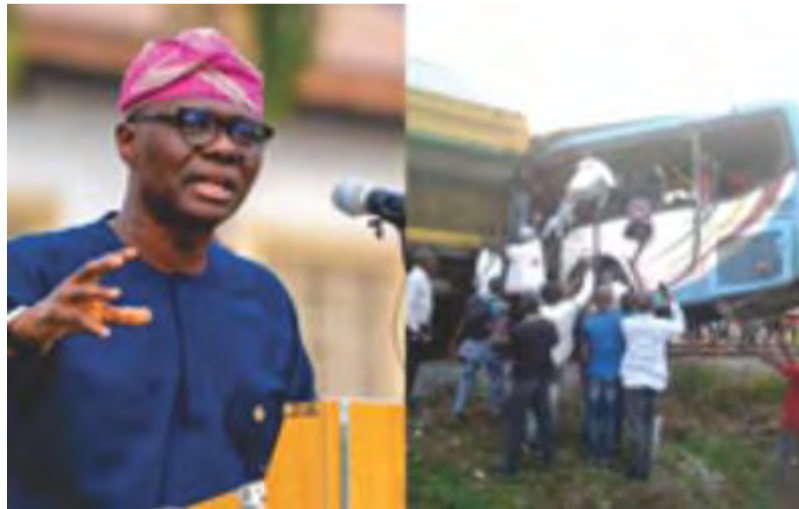
Lagos Govt Sympathises With Victims

Thursday. In a message on his Twitter account, Sanwo-Olu prayed for families of the victims and appreciated the efforts of the rescue team