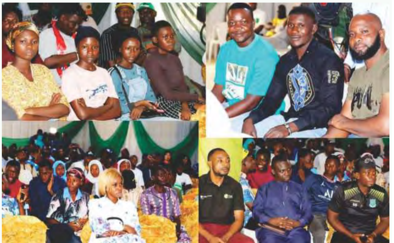
youths at the Progressive coalition youth event

"My message to youth is that you should investigate before you act; know the law before