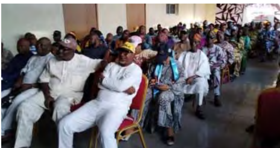
Cross section of APC members at the meeting