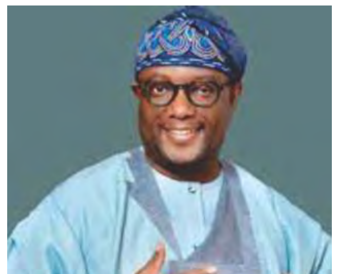
Hon. Jimi Benson

expecting nothing less than 200,000 votes in Ikorodu this Saturday. Lagos State must deliver a re-election victory to Governor