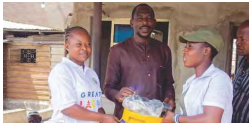
Awarding cooking gas to residents during campaign