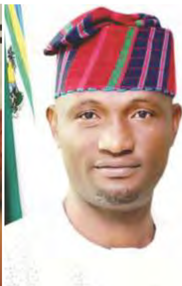
Hon. Ganiyu Egunjobi while assuring