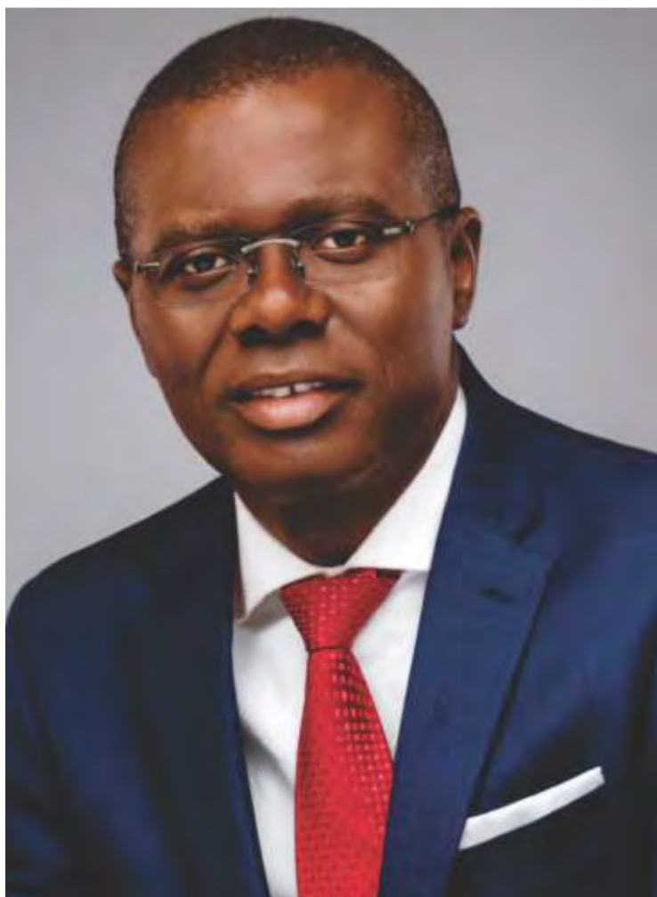
Gov. Babajide Sanwo-Olu

Until he ran for the governor, he was the Managing Director of the Lagos State Property Development Corporation. A surveyor and banker by profession, expertise, and experience have combined to put him ahead of the inexperienced in the forthcoming elections. He is the best man for the job. Vote him as Governor of Lagos State on March 18, 2023.