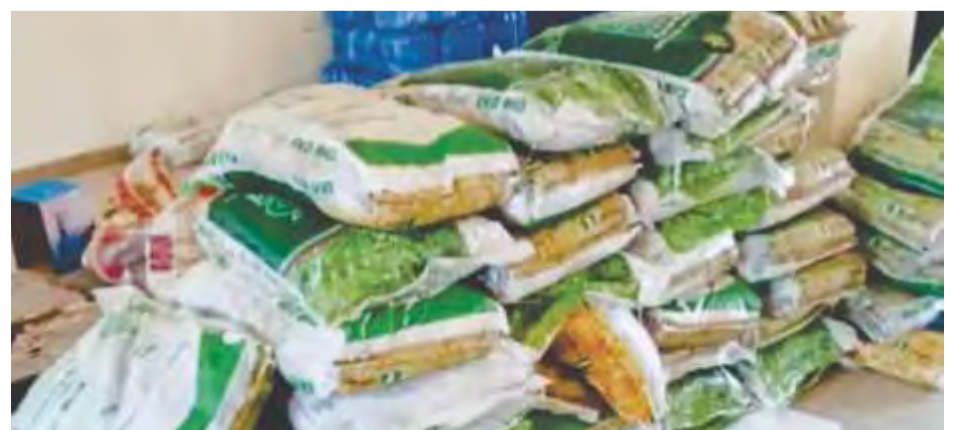
Food item support to kosofe

the community. He encouraged all eligible voters to go out and cast their votes in multitude to re-elect Governor Babajide Sanwo-Olu for the completion of ongoing infrastructural development in Kosofe and across the state. He also sensitised the women to participate actively in the forthcoming gubernatorial election.