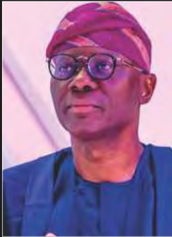
Mr. Babatunde Sanwo-Olu