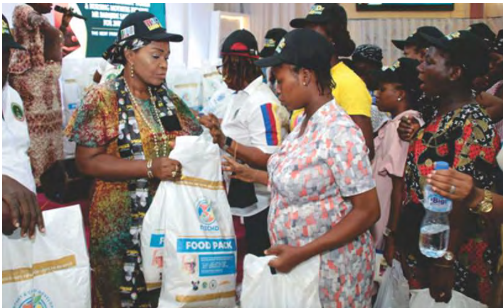
Pregnant women receiving food items

While commending the effort of the State Government on the initiative, the Commissioner said Mr. Babajide Sanwo-Olu is determined to ensure that all children in the State have access to good health, food, education and ample opportunities to excel. He added that eating healthy during pregnancy helps foetal development while