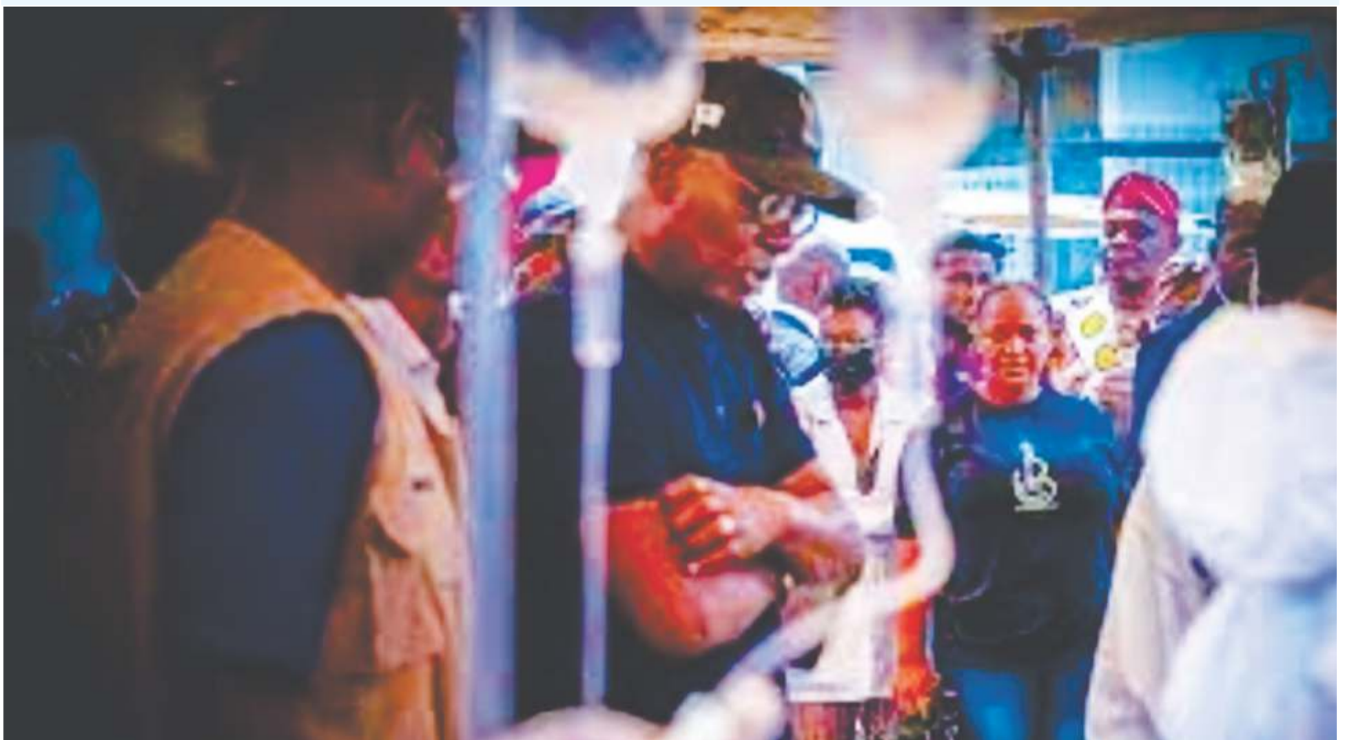
Governor Sanwo-Olu's visit to the victims of the Bus-Train crash at LASUTH

"It is a bit too early to get full details from most of the passengers or injured persons because a lot of them are in pain due to the moderate and severe injuries, so it is not a time to overstress them, but as they get better, we are going to collect more information from them."