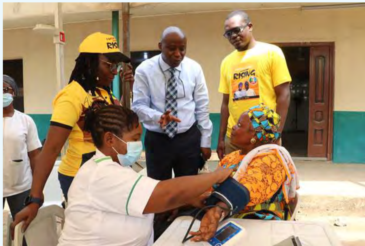
A beneficiary receiving treatment

She explained the free medical expedition programme was organized at the behest of the Governor to improve access to quality and efficient health care delivery at the grassroots as well as achieve universal health coverage particularly in