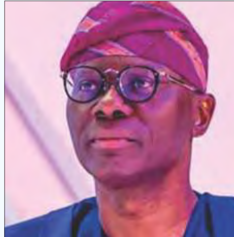
Mr. Babatunde Sanwo-Olu