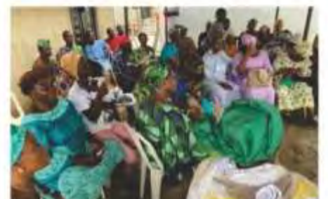
Director General, Lagos State Sports Commission (LSSC) canvassing votes from the masses

while promising to troop out on Saturday to vote for the APC candidates.