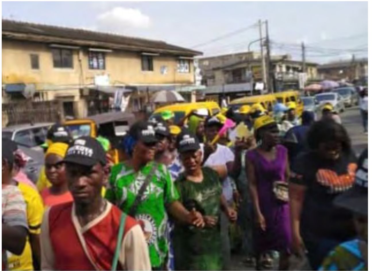
Somolu women campaign for Sanwo-Olu

women folks to come out en mass on Saturday, March 18 to vote for Babajide Sanwo-Olu and Orekoya, stating that women play significant roles in the growth and development of the society and that such should be replicated in democratic governance.